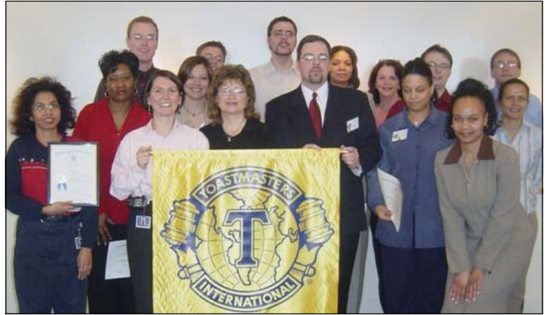
Plaza Toastmasters Charter Party, April 28, 2005