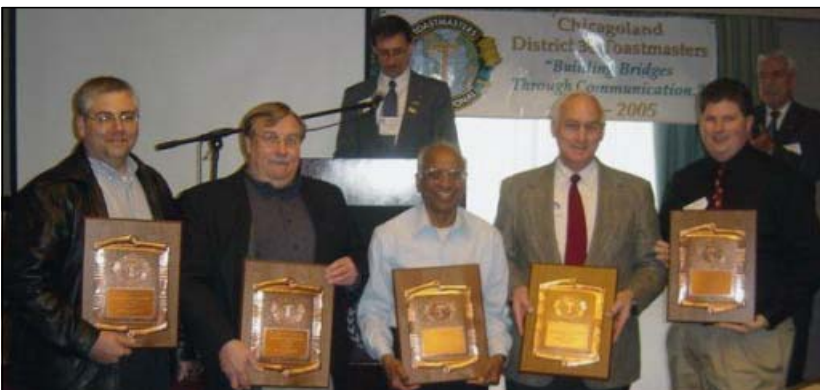
Club longevity awards, 50 Years: Addison & Elmhurst; Des Plaines; Oak Park; Daniel Wright; and Park Forest