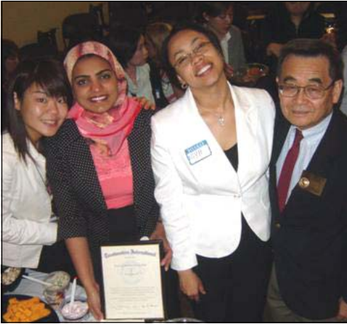
Toast of Northwestern Charter Party Wednesday, April 27, 2005